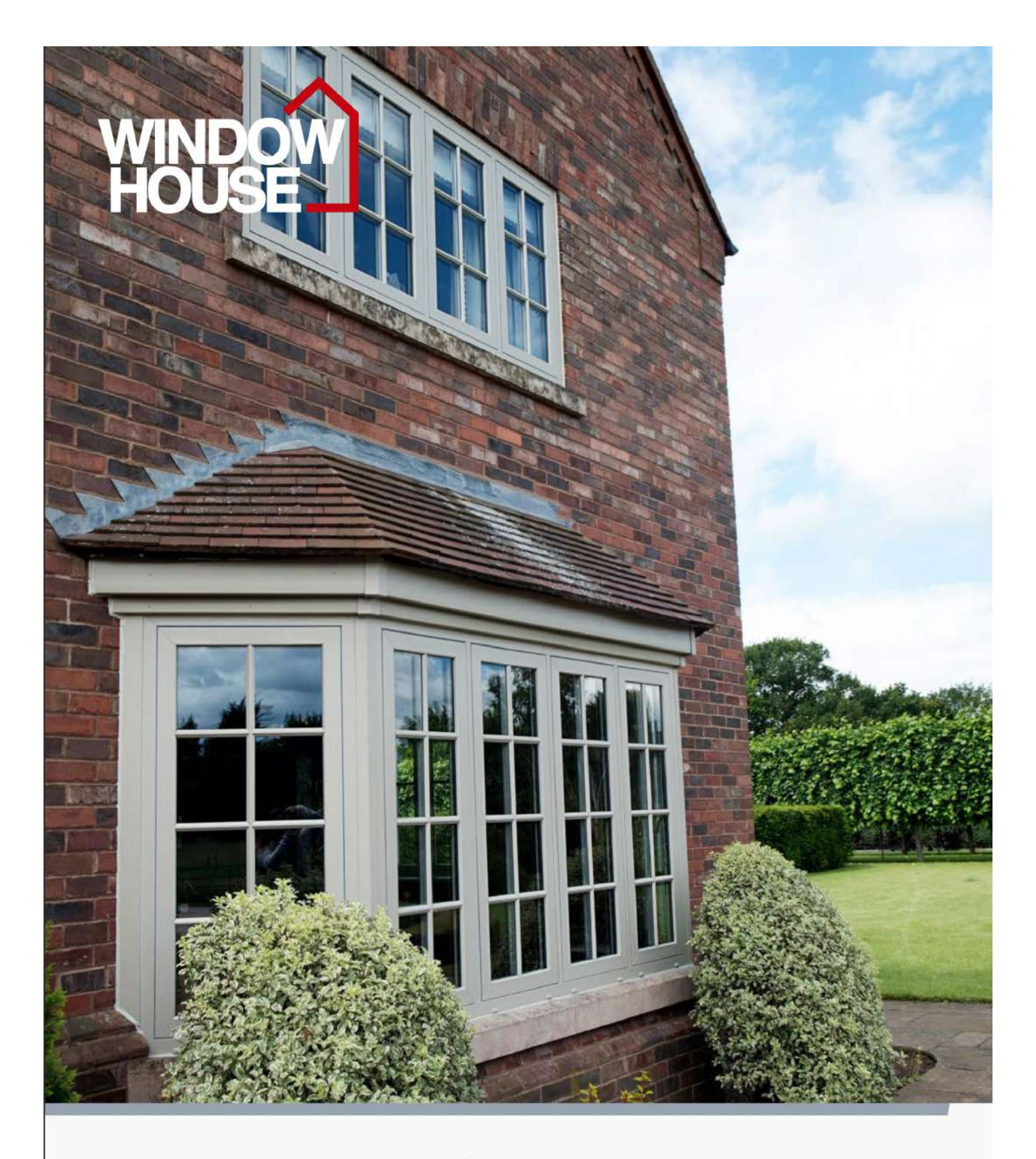
Classic PVCu Windows & Doors